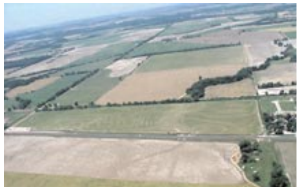
Eakas is occupying 46 acres of this 800-acre parcel in Wynne, providing one more explanation for why the Arkansas town is known as the "City With a Smile."